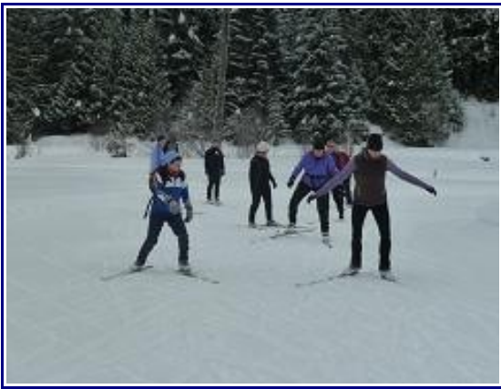
Skate Ski Clinic January 2015 – Awesome Technique!