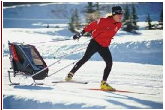
Visit us at www.nelsonnordicski.ca